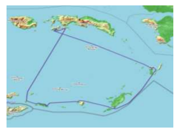
Figure 1. MV. Sabuk Nusantara 71 Operational Route Ambon – Tual – Ambon with a length of 1124 nautical miles

Table 3 presents the original generator specification data on MV. Sabuk Nusantara 71, which is utilized as a research object, as well as a new generator that will be evaluated and simulated alongside the original generator. The information in table 3 is derived from freely available accessible sources. This study also needs data on the power requirements of motor equipment that runs on electricity and is considered to be at full operational load at night.