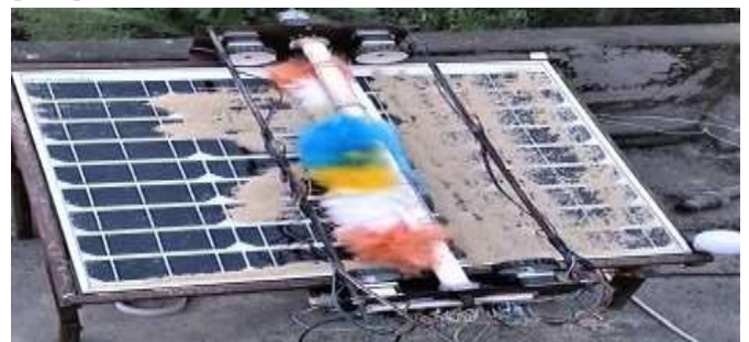
Figure 1: Robotic Unit: Fabricated Prototype [16]

In recent years, there has been an increased interest in the use of IoT-based robotic cleaners for PV panel cleaning [11,15]. These cleaners can provide several advantages over traditional cleaning methods, including increased efficiency, reduced labor costs, and improved performance monitoring. Moreover, the integration of artificial intelligence (AI) algorithms and machine learning techniques into these cleaners can further enhance their efficiency and performance [2,13].