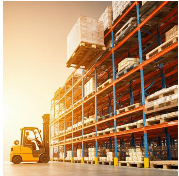
Figure 3. Horizontal Conventional Racking

In conventional shelves, a larger area is needed because there is still a lack of vertical area utilization in a storage area.