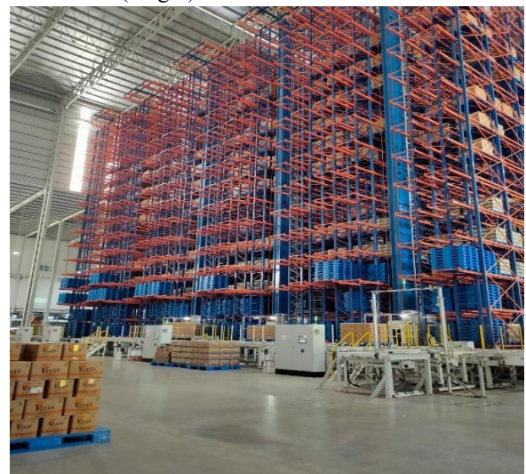
Figure 1. ASRS Storage Area

In this discussion, we will focus on the application of Automated Storage and Retrieval System (ASRS) in a warehouse with a total storage capacity of 11,660 pallets, which uses 5 cranes as a means of moving goods. This warehouse has a size of 55 meters (length), 41 meters (width), and 30 meters (height).