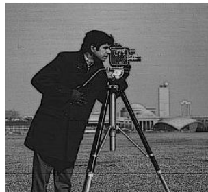
Figure 3 Original cameraman image Figure 4 Enhanced cameraman image

Figure 5, shows the original image of the couple with initial fitness value 0.29 and figure 6 shows the enhanced version of the figure 5 with fitness value 0.639