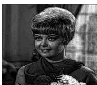
Figure 7 Original lady image