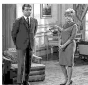
Figure 5 Original couple image Figure 6 Enhanced couple image

Figure 7 shows the original image of the lady with initial fitness value 0.22 and figure 8 shows the enhanced version of the figure 8 with fitness value 0.585.