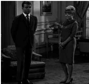
Figure 5, shows the original image of the couple with initial fitness value 0.29 and figure 6 shows the enhanced version of the figure 5 with fitness value 0.639