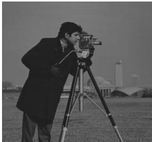
Figure 3 shows the original image of the cameraman with initial fitness value 1.14 and figure 4 shows the enhanced version of the figure 3 with fitness value 1.721.