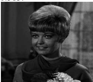
Figure 7 shows the original image of the lady with initial fitness value 0.22 and figure 8 shows the enhanced version of the figure 8 with fitness value 0.585.