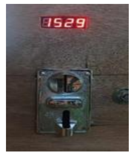
Figure 4. Functional Systems