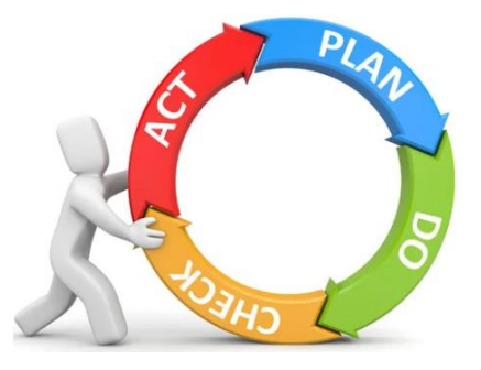
Figure 1. PDCA Method for the Project

aligns seamlessly with the objectives of the capstone project, providing a structured framework for addressing challenges and implementing solutions. By adopting the Plan-Do-Check-Act (PDCA) methodology, the project guarantees a systematic and disciplined approach to problem-solving, facilitating the successful implementation and refinement of solutions.