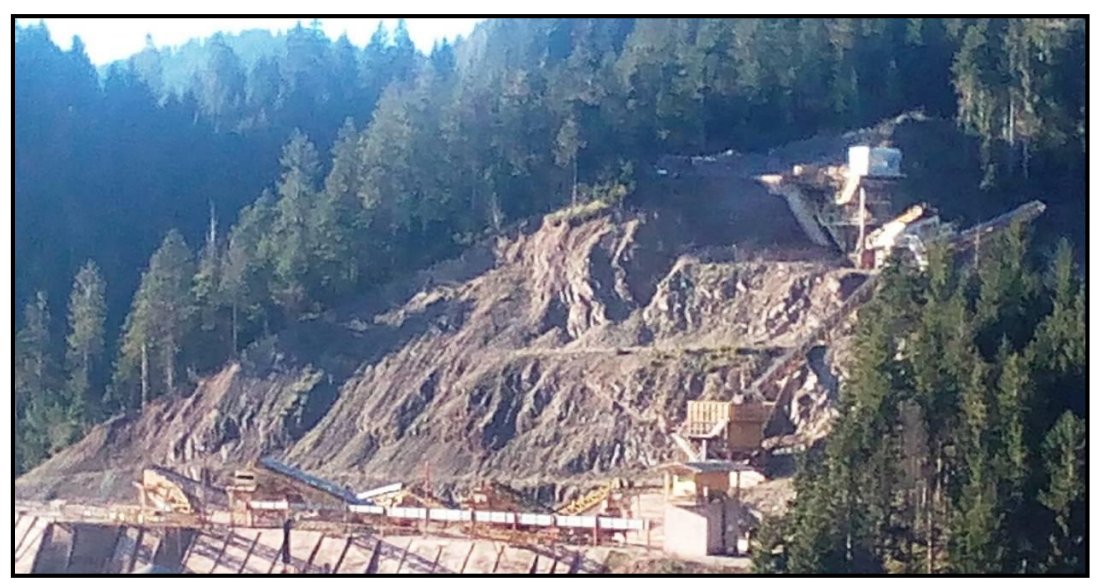
Figure no.3 Seperation plant for limestone processing "Kota" near Vareš