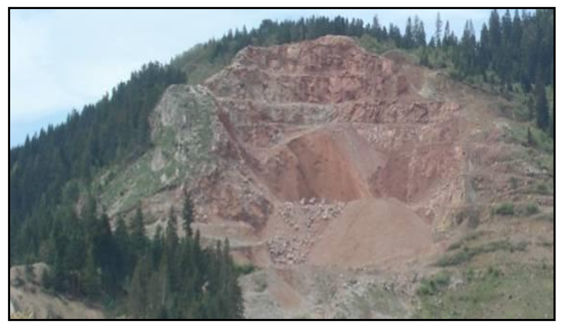
Figure no.2 "Kota" limestone quarry near Vareš

"Influence of Dust Emission Emitted from the Surface Quarry of Technical Stone on Air Quality"