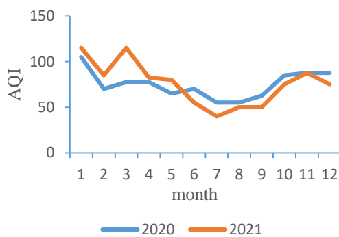
Figure 2. Monthly average statistical chart of air quality index (AQI) in Jiaozuo agglomeration area

From Figure 1, it can be seen that from 2019 to 2021, the single index of PM 2.5 is between 1.37 and 1.80, the single index of PM 10 is between 1.43 and 1.56, the single index of SO 2 is between 0.17 and 0.22, the single index of NO 2 is between 0.70 and 0.93, the single index of O 3 is between 0.19 and 0.55, and the single index of CO is between 0.17 and 0.22. The five factor indexes of SO 2 , NO 2 , PM 2.5 and CO show a downward trend year by year, and the SO 2 index has no significant change. The PM 10 index increased from 1.43 to 1.46 in 2021 compared with 2020. From the perspective of individual index, PM 2.5 and PM 10 were the main pollutants. The average concentration of air quality in Jiaozuo City for 24 hours was calculated monthly and the air quality index was calculated, and Fig.2. It can be seen from Fig.2 that the average value of AQI in the study area increased from October to the highest value in January of the second year, decreased from January to July, and the lowest value in August.