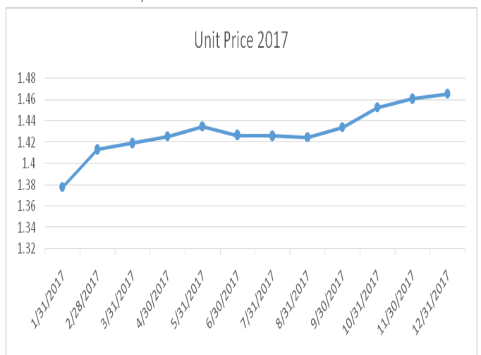
Graf.2. Unit Price, 2017

stock market. The most important global stockpiles captured historic records in a double-digit growth year. This growth was based on (generally) very good indicators of economic growth and declining unemployment in the US, the EU and important Asian countries, but also by a favorable investment environment, where fiscal facilities continued to be in place for 2017 Apart from the movement of markets, the investment strategy and the tactical allocation by the Governing Board were significant, thus enabling the harvest of highly satisfactory returns from investments. This despite the fact that KPST has an investment portfolio that maximally maintains the balance between risk and potential gain. Thanks to these factors, this was also the year with the lowest volatility of the investment portfolio of KPST.